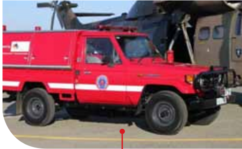
Mountain Search and Rescue – use of a Land Cruiser 4 X 4 vehicle for search & rescue

Despite the challenges to the Group over the last year our core divisions continued to participate in a number of Corporate Social responsibility initiatives. These included support of: