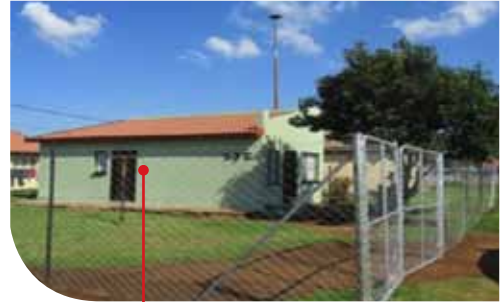
Community of Orange Farm – rebuilding of a house and other activities in the community